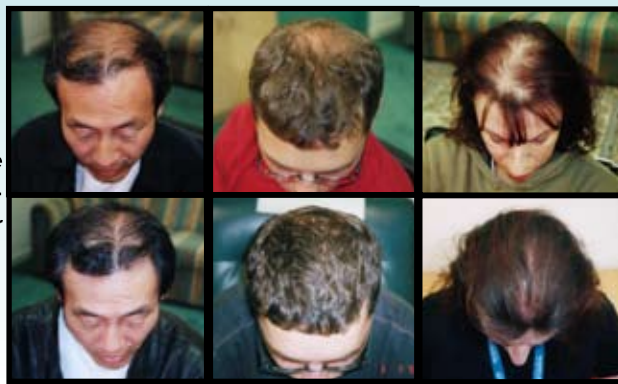
Hair Rejuvenation after 3 Months on program