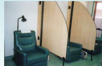
Scalp Treatment Booth

This process is sometimes alternated with Step 3 (Hair Treatment), depending on hair status, and involves introducing nutrients directly into the scalp by way of fine needling.